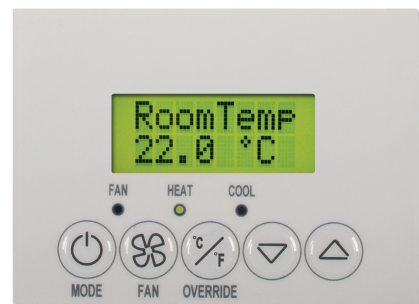
Hotel and Lodging Application